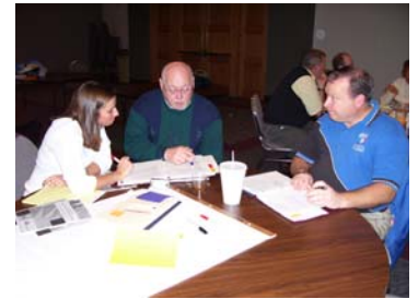
School officials develop wellness policies.

tive project funds tobacco education activities in Coshocton, Morgan and Muskingum Counties. In 2006, ZMCHD provided funding to Muskingum Behavioral Health and Big/Brothers/Big Sisters of Zanesville. Each of these agencies along with the Health Department provided a variety of services to prevent tobacco use in teens, to help adults to quit, and to increase awareness about the dangers of secondhand smoke and the importance of smoke-free workplaces.