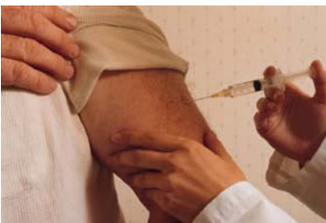
Immunizations protect against diseases.

One of ZMCHD's most important tasks is controlling the spread of communicable diseases. Laws require that over 50 communicable diseases be reported to the local health department. Employees conduct investigations, provide treatment, trace contacts and take other measures to prevent these diseases from spreading