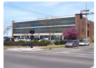
205 North Seventh Street in Zanesville.