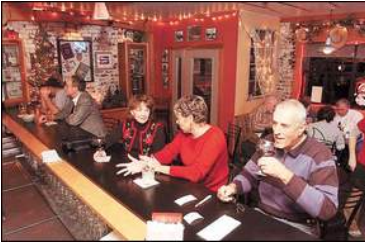
The public enjoys a smoke free place.

Ohio voters passed Issue 5 on November 7, 2006, creating Ohio's indoor smoke free workplace act under a new chapter of the Ohio Revised Code effective December 7, 2006. This new law requires "public places" and "places of employment" to be smoke free as of that date. Although the Ohio Department of Health (ODH) cannot levy fines until the rules are adopted, businesses must do three things to comply: prohibit smoking; post no-smoking signs with the toll-free enforce-