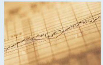
Daily bulletins between ZMCHD and schools alert us to unusual illness patterns.

partners participated in a full-scale emergency exercise October 16, 2007 at the Zanesville McIntire Post Office and at the ZMCHD. The event tested local emergency response plans in the event of a biohazard alert. ZMCHD established a Point of Dispensing (POD) site to provide prophylaxis to postal employees suspected with possible biological contamination.