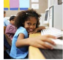
ZMCHD offers School Health Education and is designated as a Childhood Lead Regional Resource Center.

for providing training, support and information about lead to medical providers, health departments, media outlets, social service agencies and clinics. The Southeast Regional Resource Center supports the following counties: Athens, Belmont, Gallia, Guernsey, Hocking, Jackson, Lawrence, Meigs, Monroe, Morgan, Muskingum, Noble, Perry, Pike, Ross, Scioto, Vinton, Washington. The Regional Resource Center is working in conjunction with the state to meet the goals of Ohio's Plan to Eliminate Childhood Lead Poisoning by 2010.