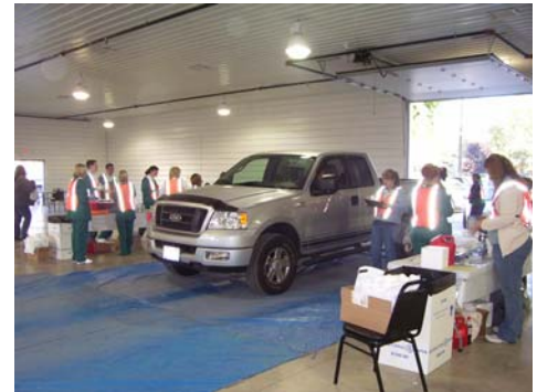
Mass Immunization Exercise

immunizations to a large number of people in a short amount of time. Nearly 3,286 vaccines were given to Muskingum County residents.