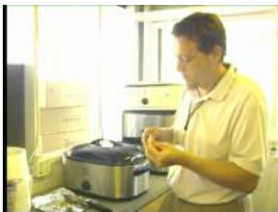
Food Service Inspection at Muskingum County Fair

Public health nurses also work with schools and provide case management for children with special health care needs.