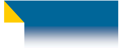
Community Obesity Prevention Grant Meeting

based on local resources and needs. Funds will also be used to improve several walking trails in the community and to encourage people with all skill levels to use the trails. ZMCHD will also promote two community gardens.