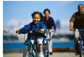
Make health a priority.

Big Red Dog was a success. Dozens of children received free immunizations and several adults received free health screenings.