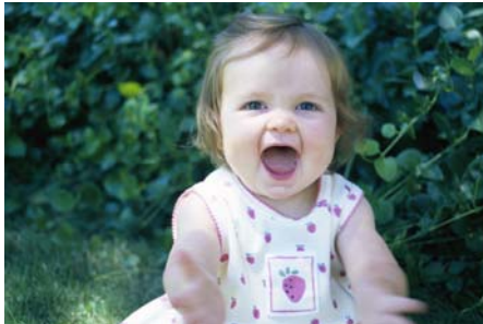
Vaccination is An Act of Love.