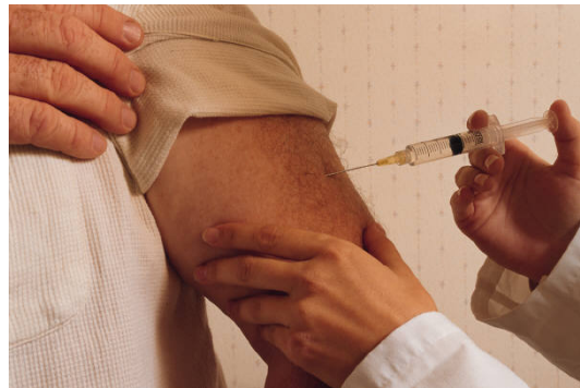
The best way to prevent the flu is to get vaccinated each fall.