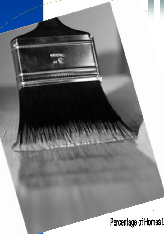
Percentage of Homes Likely to Contain Lead