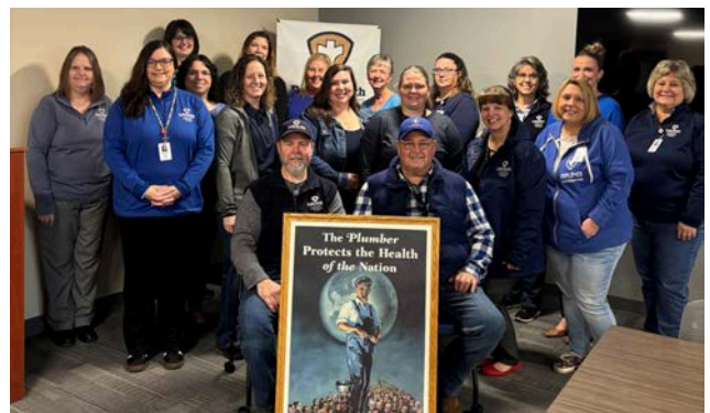
Celebrating World Plumbing Day on March 11th