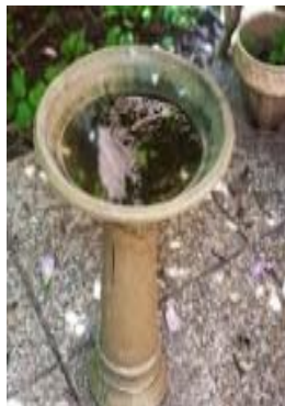
A forgotten Bird Bath is a perfect breeding environment

Bird baths should be drained and re-filled at least weekly.